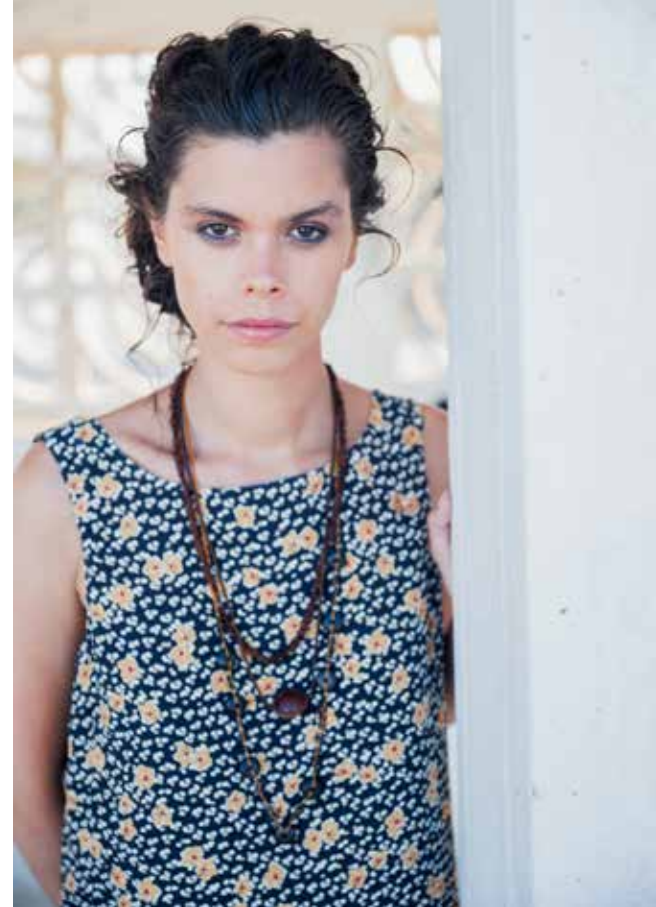
Sleeveless dress Racale