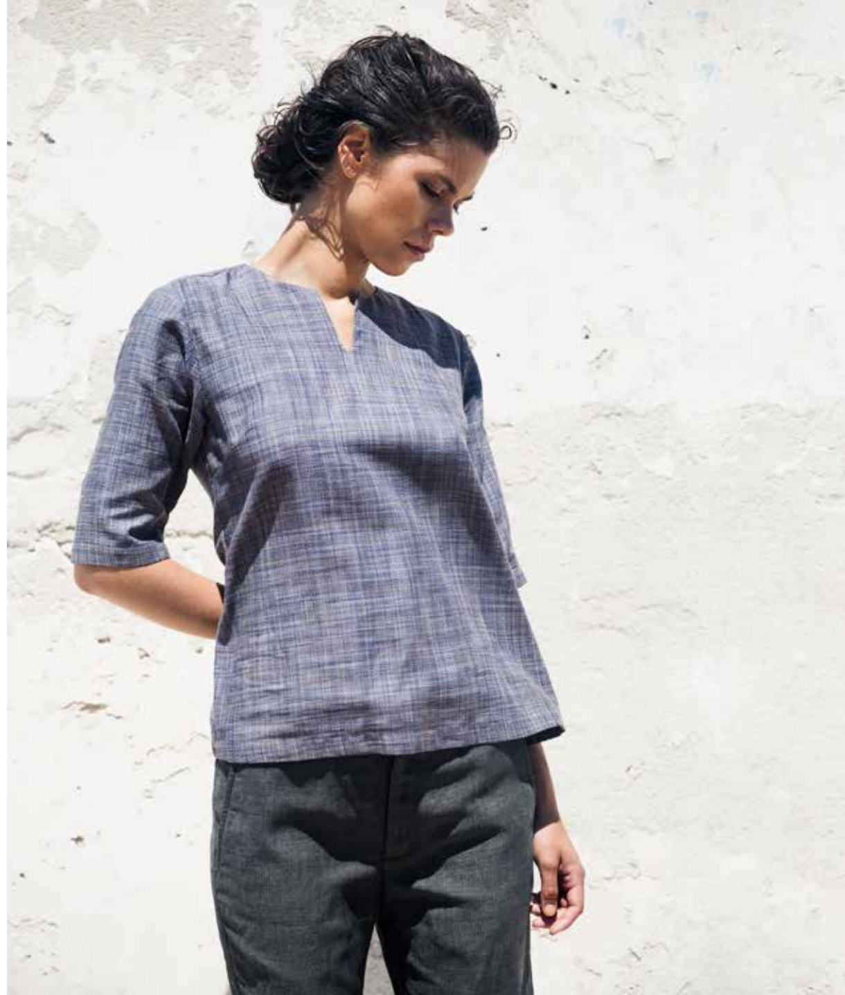
Tunic Corsari trousers San Cataldo