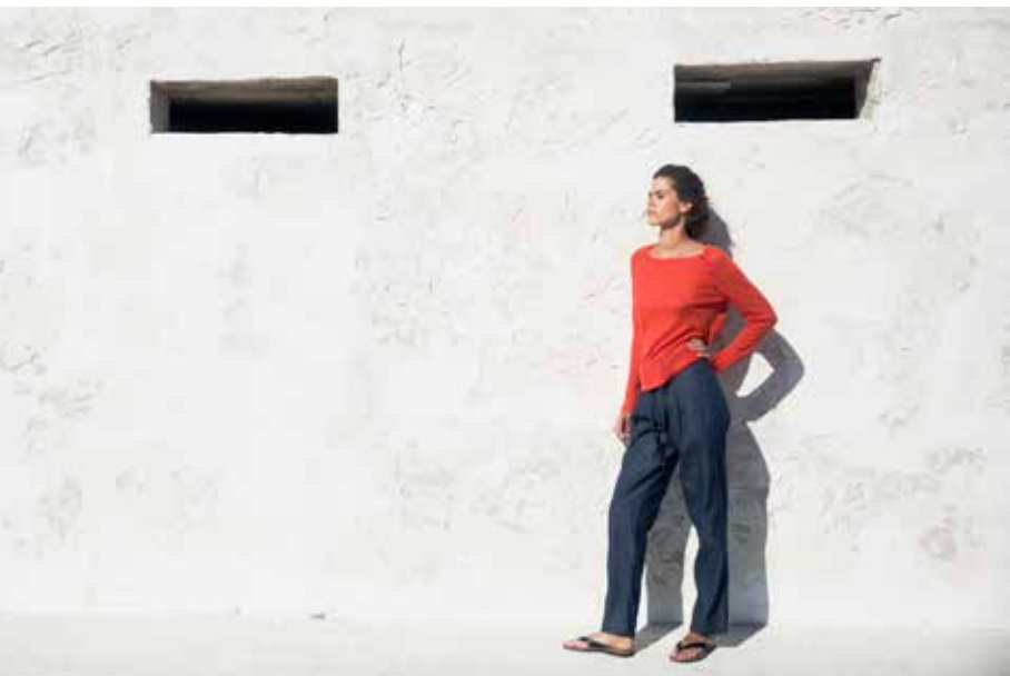
Sweater Ristola trousers Frigole